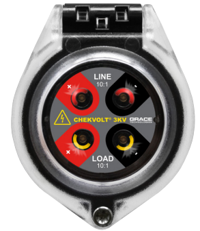
R-3MT-VI-3K/10LL-KIT Includes cap

Testing voltage for DC systems up to 3kV shouldn't be a gamble with safety. If you're working in utility-scale solar power, electric vehicles, electric rail systems, or EV charging stations, you are aware of the danger. Traditional methods for testing voltages above 1000 VDC demand specialized equipment, expose your team to increased electrical hazards and prolong Lockout/tagout (LOTO) procedures.