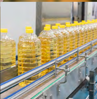
FOOD AND BEVERAGE PRODUCTION