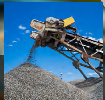
MINING AND RAW MATERIAL HANDLING

The Fluke ii910 Precision Acoustic Imager with MecQ™ is a powerful solution that can significantly reduce unplanned downtime by locating potential issues in conveyor systems so they can be addressed on your maintenance schedule.