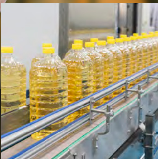
FOOD AND BEVERAGE PRODUCTION