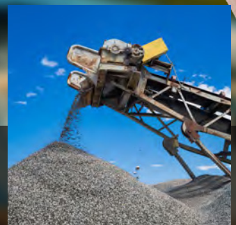
MINING AND RAW MATERIAL HANDLING

The Fluke ii910 Precision Acoustic Imager with MecQ™ is a powerful solution that can significantly reduce unplanned downtime by locating potential issues in conveyor systems so they can be addressed on your maintenance schedule.