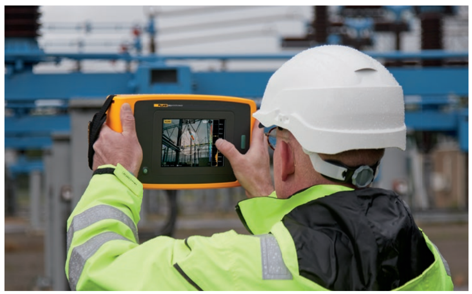
Image taken of the ii910 Precision Acoustic Imager detecting partial discharge in a high voltage application.