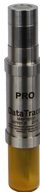
MPRF Pressure Data Logger