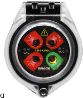
R-3MT-VI-KIT Includes cap and labels

Performing Lockout/Tagout (LOTO) safely requires the answer to one question; is there voltage? NFPA 70E/CSAZ462 requires an absence of voltage test to verify an electrically safe work condition. The traditional process poses arc flash and shock hazards to comply with NFPA 70E Article 120.5: Process for Establishing and Verifying an Electrically Safe Work Condition.