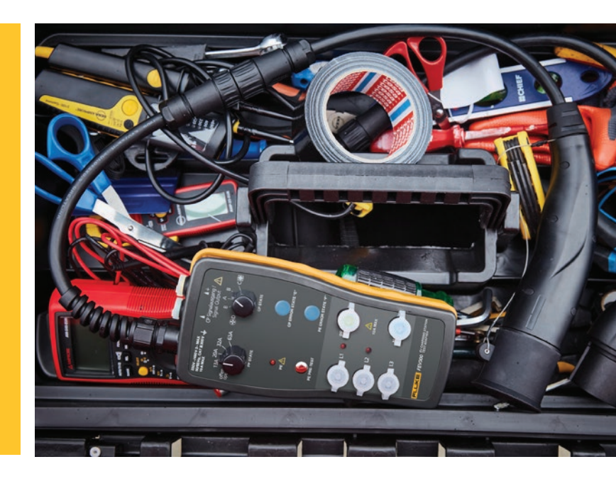
Fluke. Keeping your world up and running.

©2022 Fluke Corporation. Specifications subject to change without notice. 7/20222 220450-en