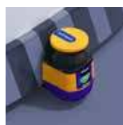
Safety Laser Scanner