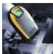
Hand Held scanners