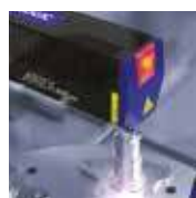
Laser Marking Systems