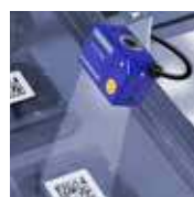
Stationary Industrial Scanners