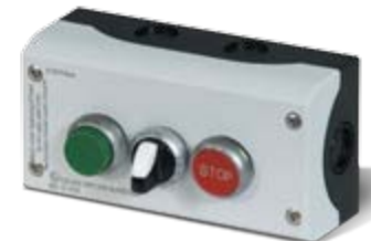
3-Operator Control Station.