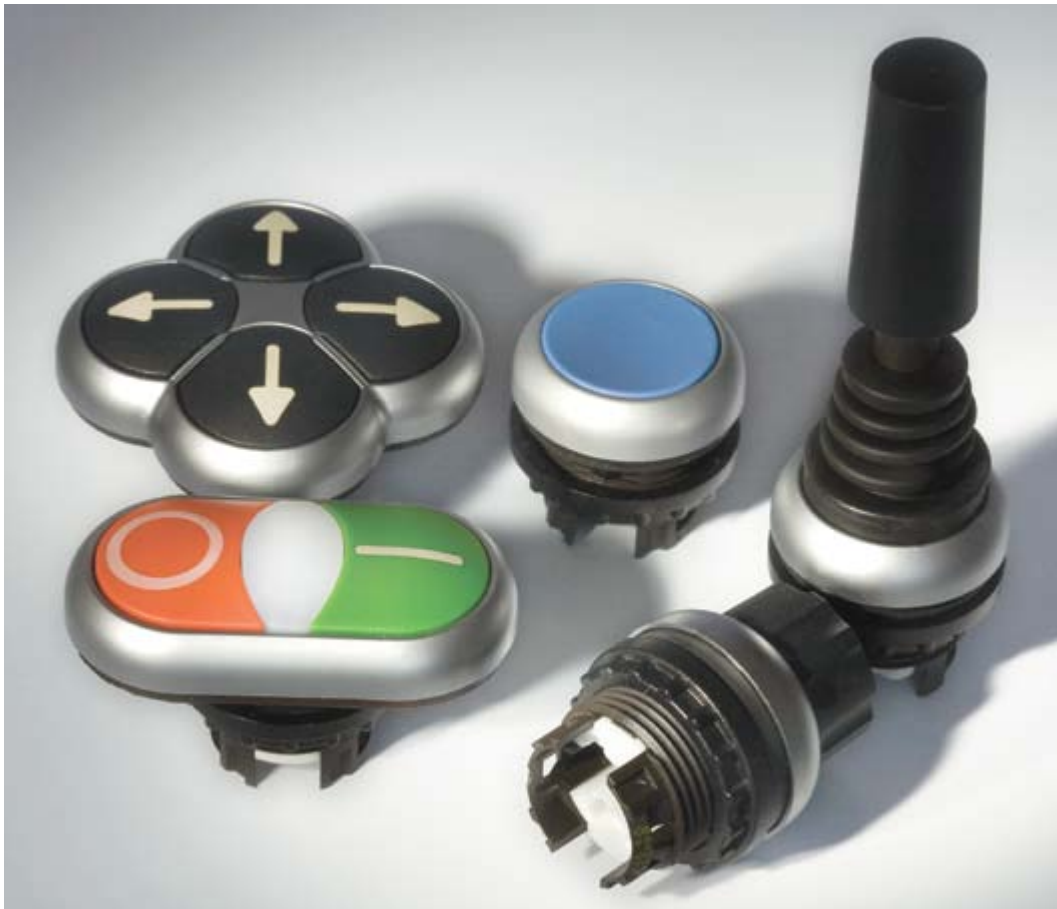
A variety of operator types makes the M22 line flexible for your specific application needs.

For unfavorable environmental conditions, operators can be protected by diaphragms and plastic covers, ensuring adequate protection from the elements. Most M22 devices are protected to IP67 and IP69K standards, allowing for use in harsh environments and providing ease of cleaning—even with high-pressure and steam cleaners, an important benefit in applications where utmost cleanliness is vital.