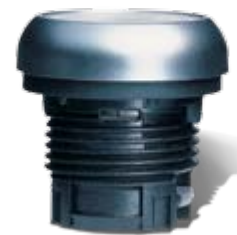
Slide the small lever to change a pushbutton operator from momentary to maintained status.