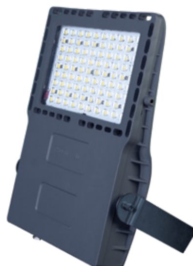
Zone 21, 22 LED High Power Floodlight