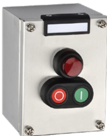
Stainless Steel Zone 1,2,21,22 Pushbutton Station