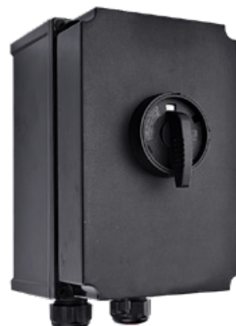
Zone 1,2,21,22 Isolator