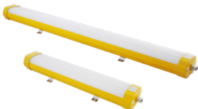
Zone 1, 21, 2, 22 LED Hazardous Area Floodlight