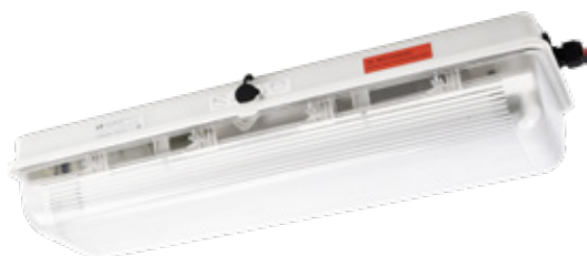
Zone 1, 21, 2, 21 LED Hazardous Area Luminaire