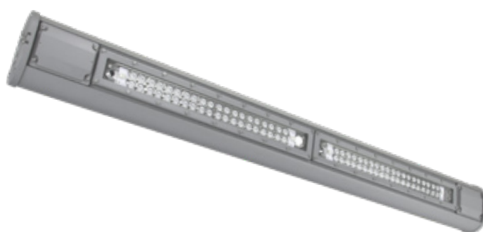
Zone 1, 21 LED Hazardous Area Floodlight