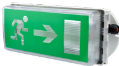
Zone 1, 21, 2, 22 LED Emergency Exit Luminaire