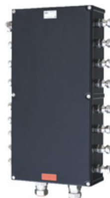
Zone 1,2,21,22 Terminal Enclosures