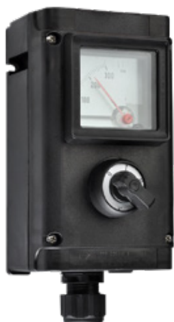
Zone 1,2,21,22 Control Station