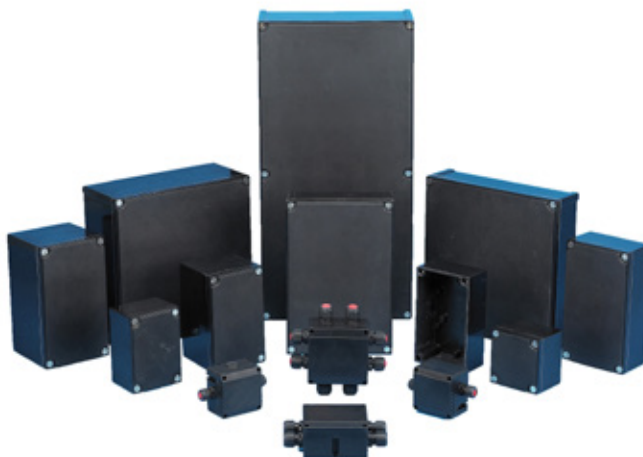
Zone 1,21 and IS Terminal Enclosures