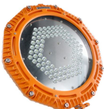
Zone 1, 21, 2, 22 LED Hazardous Area Floodlight