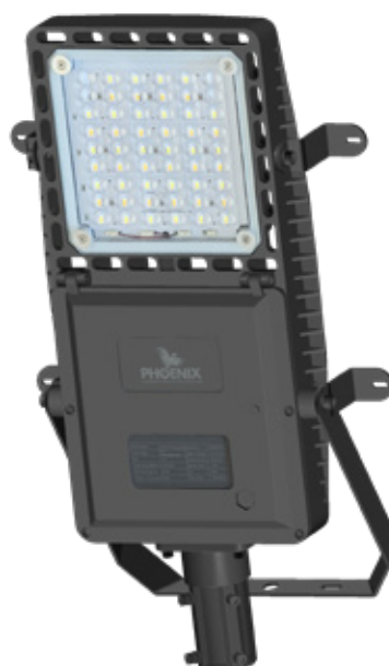
Zone 21, 22 LED Conveyor/Bulkhead Floodlight