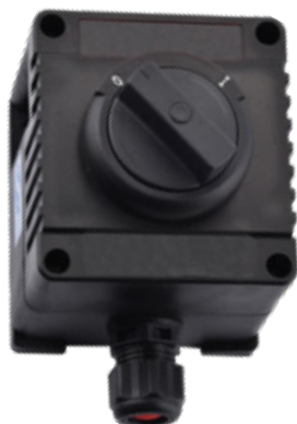
Zone 1,2,21,22 Switch