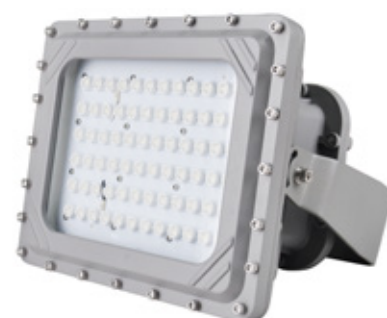
Zone 1, 21 LED Hazardous Area Floodlight